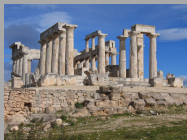
The temple of Afaya or of Afea, is one of the three temples of the sacred triangle of the Partenón, Sunión and Afaya. It is located on the Argosaronian island of Aegina. It was for a long time considered the temple of Panhellenic Zeus, after Athena