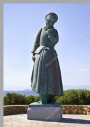
Statue of mothers in Greece Aegina