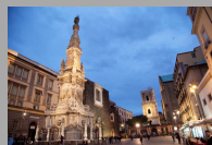
Plaza of the New Jesus of Naples