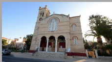
The Cathedral of Aegina, basilica with three red domes, was built in 1806 with donations from the inhabitants and the monastery of the Virgin Chrysioleontissa.