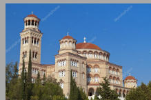
Saint Nektarios church on the island of Aegina in Greece