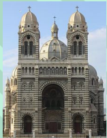
Notre-Dame de la Garde is a Catholic basilica in Marseille, France, and the city's best-known symbol.

Marseille Cathedral is a Roman Catholic cathedral, and a national monument of France. It has been a basilica minor since 1896.