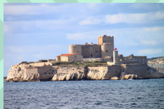
The Chateau d'If is a fortress (later a prison) located in the island of If.