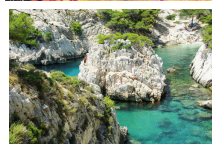
Calanque de Sugiton

Cours Julien and its surroundings is one of the fashionable areas of Marseille. The facades of the neighborhood are covered by murals and graffiti.