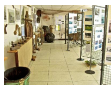
Petit Musée de Carro

Thee are banks, tables, a small farm, west, horses only place of relaxation with soft drinks and carousel.