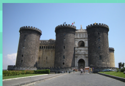
Castello Maschio Angioino is a castle built the year 1279.

Morning: First we take a bus and go to the airport. Then we take an airplane. Finally we go to Tirana