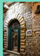
Lama Monachile is a beautiful beach but is very small.