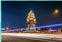
The Independence Monument of Vlorë dedicated to the independence of France.