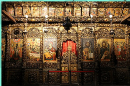
The National Iconographic Museum Onufri is a big catholic museum of Vlorë.

Morning: First we take a rent car and go to Tirana. Then go to the airport. Later we take an airplane. Finally we go to Crete