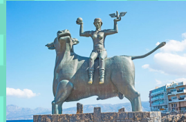
Europa statue crete is a statue symbolizes Europe.

Morning: First we take a bus and go to the airport. Then we take an airplane. Later we go home, Ciutadella. Finally we take a bus and go to Ciutadella.