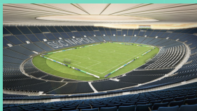
Stadio San Paolo is a big football stadium of Naples. It fits 60.240 people.

Morning: First we take a bus and go to the Castello Maschio Angioino (24 euros in total, 6 for person). Then visit all the castle. After we eat our picnic.