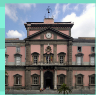
National Archaeological Museum of Naples is the best museum of Naples.