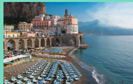
Amalfi Coast is a big beach of Naples.