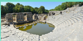
The Butrint National Park It is one of the most important archaeological sites in Vlorë.